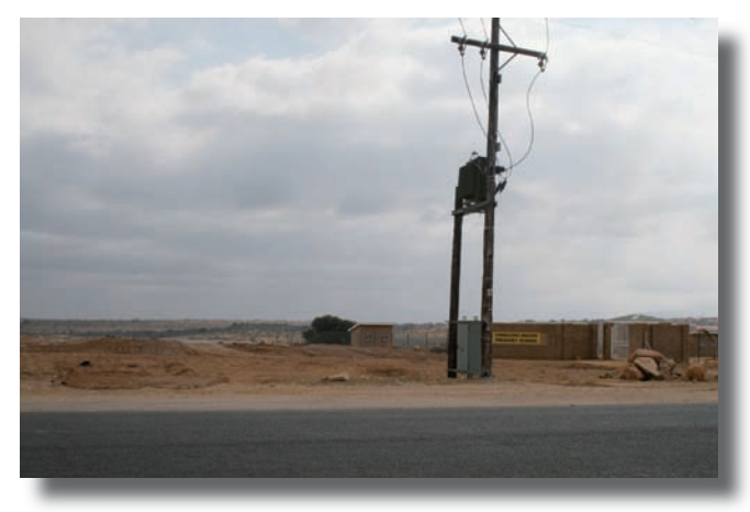
Open land next to the new school where the conrete batch was situated, July 2008

PPL instructed the contractor, Group 5 Housing to formalise the plant's decommissioning by removing the plant from the site by 2 May 2008.<sup>124</sup> Anglo Platinum later confirmed that Group 5 Housing had informed them that the plant had been dismantled and that "site remediation" was underway on 26 May 2008.<sup>125</sup> Anglo Platinum stated that it was currently undertaking remediation of the relevant land and a possible use still under consideration was that of an extension of the school sports fields.<sup>126</sup>