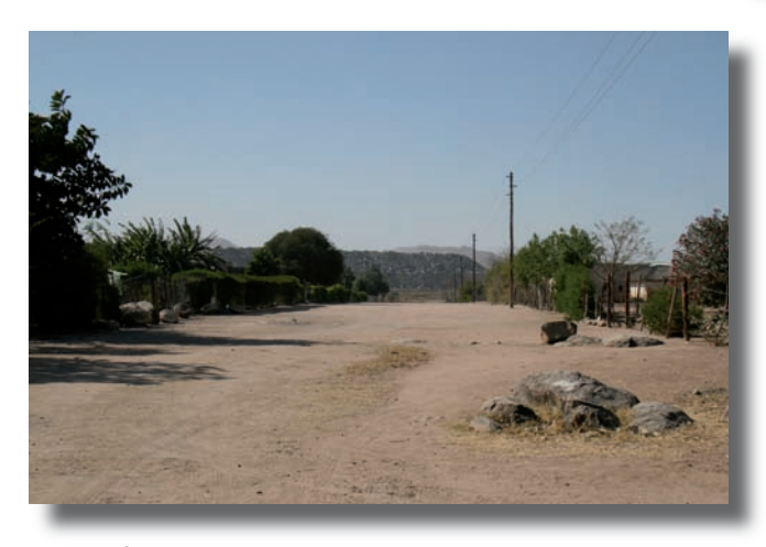
View of a mine dump adjacent to Ga-Chaba