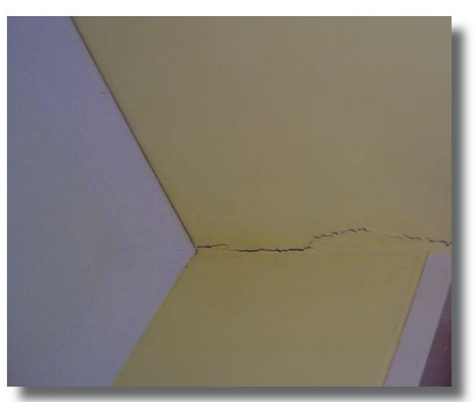
Cracks in a house in Sterkwater

PPL does not bear explicit obligations to provide electricity to residual communities and there is no human right to electricity as such. However, in developing and signing Service