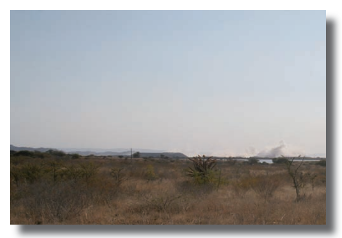
Blasting at the PPL mine in July 2008

surrounding communities caused by blasting at the mine may not be fully addressed.