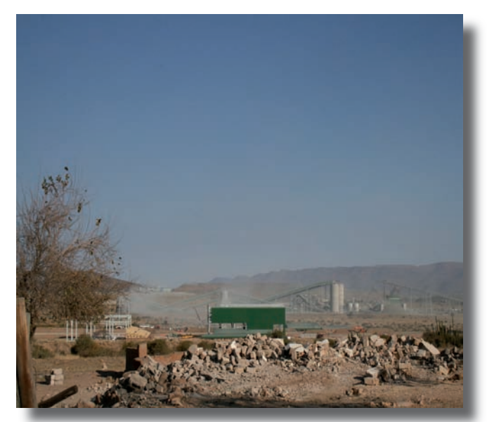
View of the PPL mine from Ga-Puka

The PPL's PPRust mine was opened in September 1993 having relocated Ga-Pila village to allow for the establishment of the mine. The PPRust North Expansion Project saw the expansion of this mining operation and development of a new pit and plant to the north of the existing mine on the Overysel and Zwartfontein farms. The villages of Ga-Puka and Ga-Sekhaolelo (Motlhotlo) are located adjacent to the sites designated for this new pit and plant.