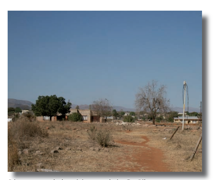
Disconnected electricity supply in Ga-Pila

During initial consultation with the residual community at Old Ga-Pila, community members claimed that they have had no electricity supplies for the last 7 years. They maintain that the Mogalakwena Municipality supplied four packets of candles to each household between February and April 2008. However, the community claims that they have received no further support since then.