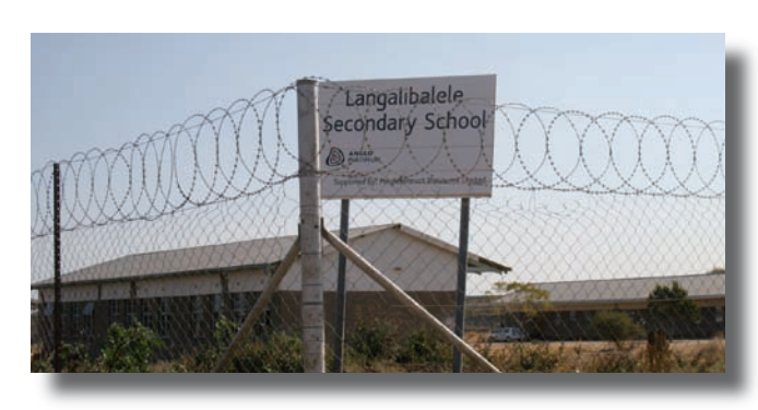
The Langalibalele Secondary School at Ga-Molekane

The SAHRC is concerned that access to education may be inhibited for the children (particularly young children) of those households yet to relocate and resistant to the relocation.