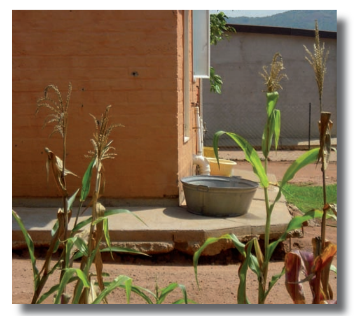
Soil erosion around house foundations in Sterkwater

Section 26 (1) "Everyone has the right to have access to adequate housing."