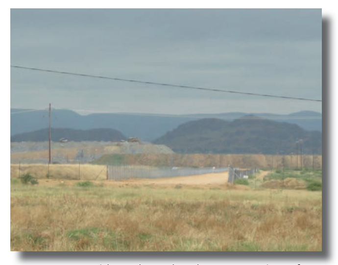
Transport corridor through the PPL mine from Motlhotlo